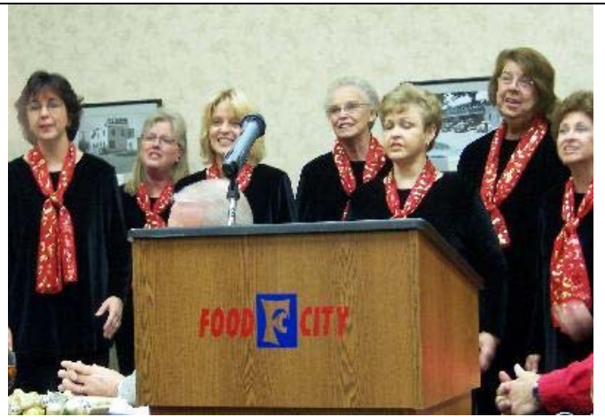
Sweet Adelines provided Christmas music at the December 21 st meeting in the Food City banquet room.