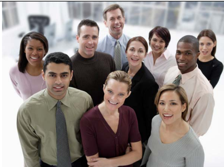
New membership program is an excellent way to engage young professionals.

The prospective new member will be introduced each week. At the end of the three months, the prospective new member will be interviewed and will decide whether Kiwanis is right for them.