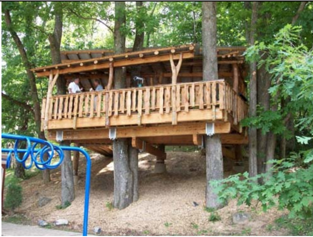
The Anderson Treehouse rests on a hillside among the trees in the Boundless Playground at Warrior's Path State Park.