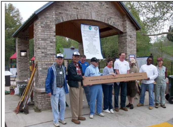
The work team accepts the token of appreciation for the continuing support of Kiwanis to the Boundless Playground.