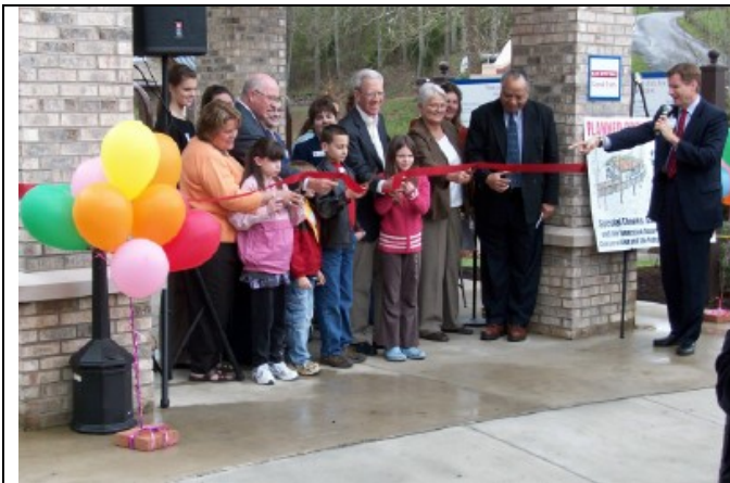
Ribbon Cutting at Grand Opening of Braille Trail.