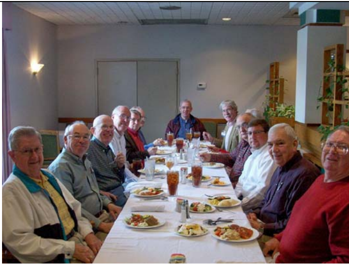
Several Kiwanians enjoy food and fellowship at the Good Friday Roundtable.