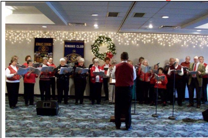
Heaven Bound Choir serenades with Christmas music.